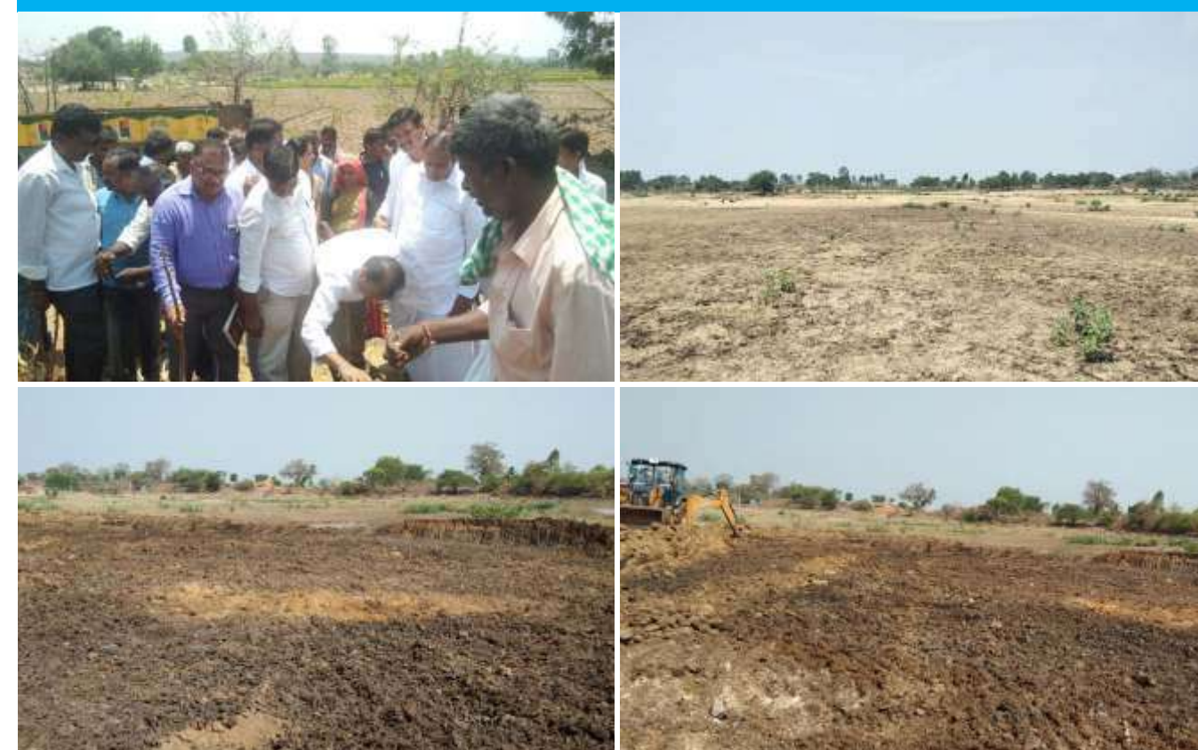
Glimpses of the set up of water storage structures