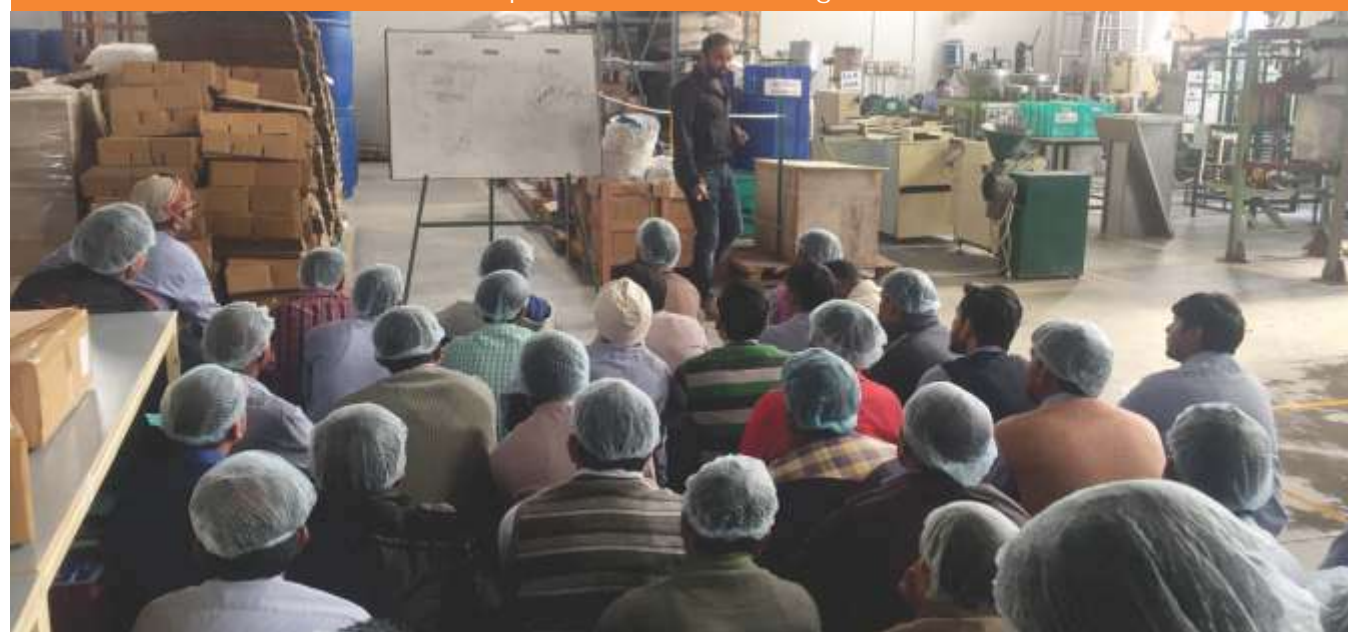
Glimpses of chemical training