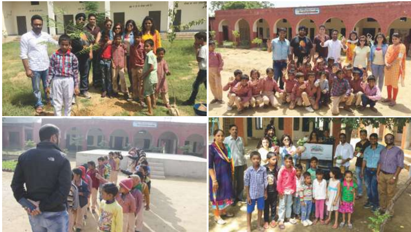
Glimpses of vegetable-herbal patch