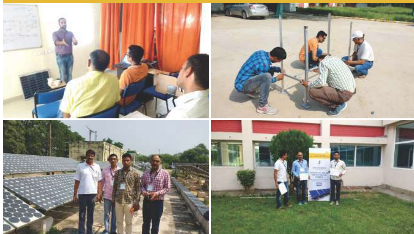
Glimpses of solar PV training at HARTRON

Advit Foundation organized a 1 week comprehensive training program in Solar energy targeting entrepreneurs. This was implemented in partnership with Haryana State Electronics Development Corporation (HARTRON). Theoretical concepts were imparted in a classroom environment while the practical aspects were taught using a portable mini power plant and site visits to various installations across Gurugram. Visit to the National Institute of Solar Energy, Gwalpahari was also facilitated.