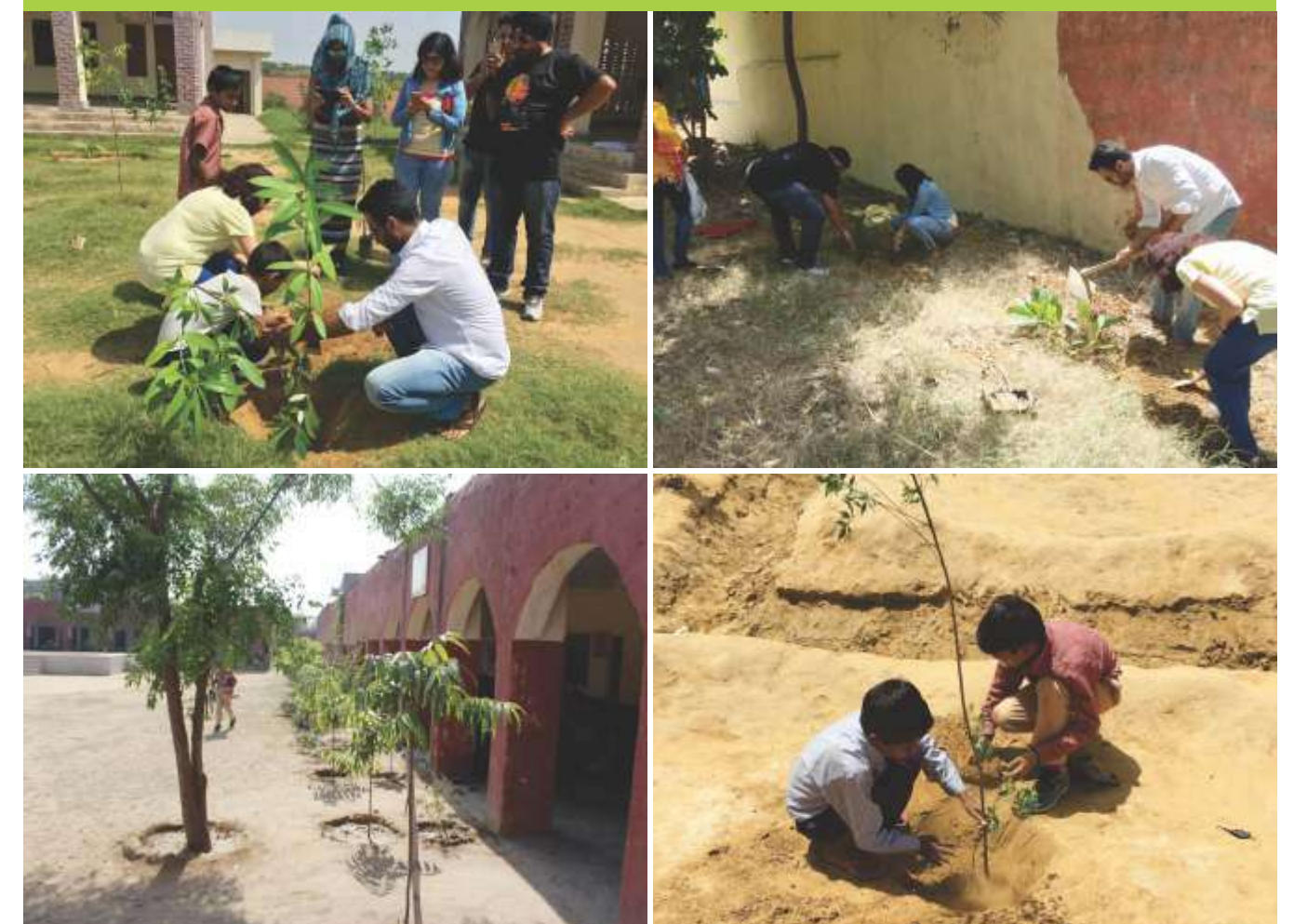
Glimpses of tree plantation