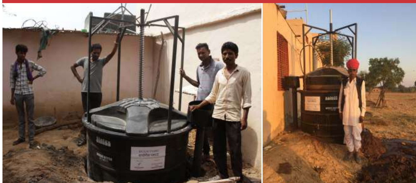
Glimpses of installation of biogas plant