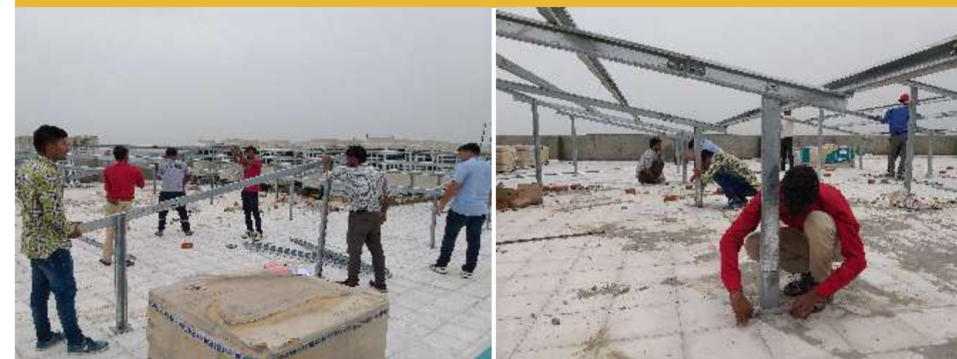
Glimpses of B.Voc – Renewable energy technology